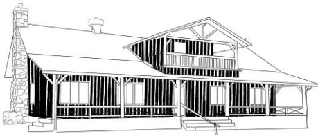
Chief Logan Lodge